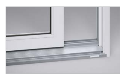
Clear Anodized outside / inside Ideal for white or light-colored doors.