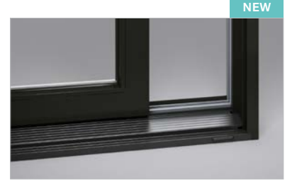
Black Anodized outside / inside (Option) Ideal for black or dark doors.