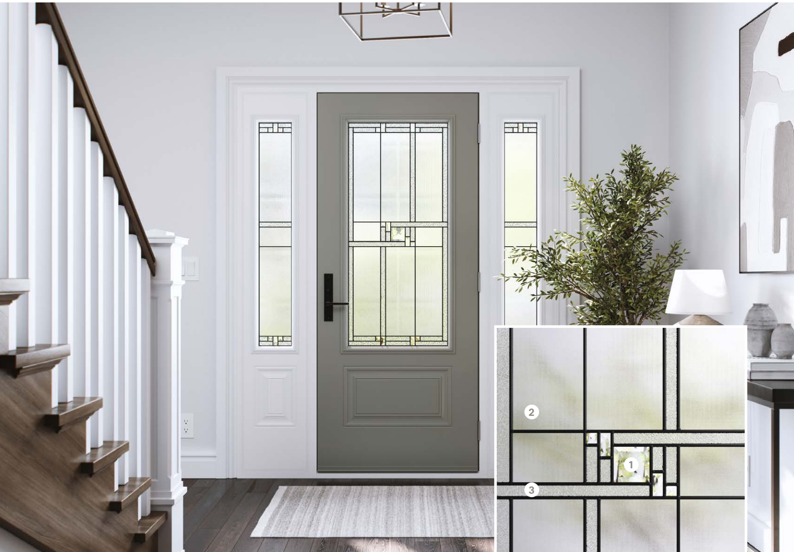
↑ Uno steel door | Rubik 22"× 48" doorglass and 8"× 48" sidelites ■ Gentek, Storm 570